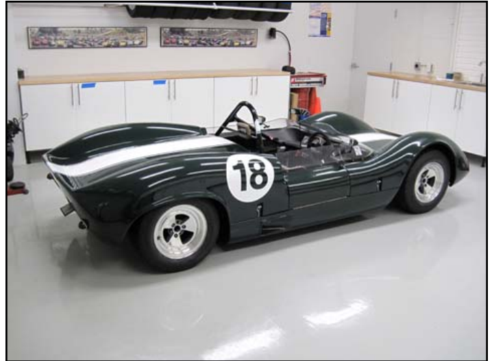
Rear Right Three Quarters