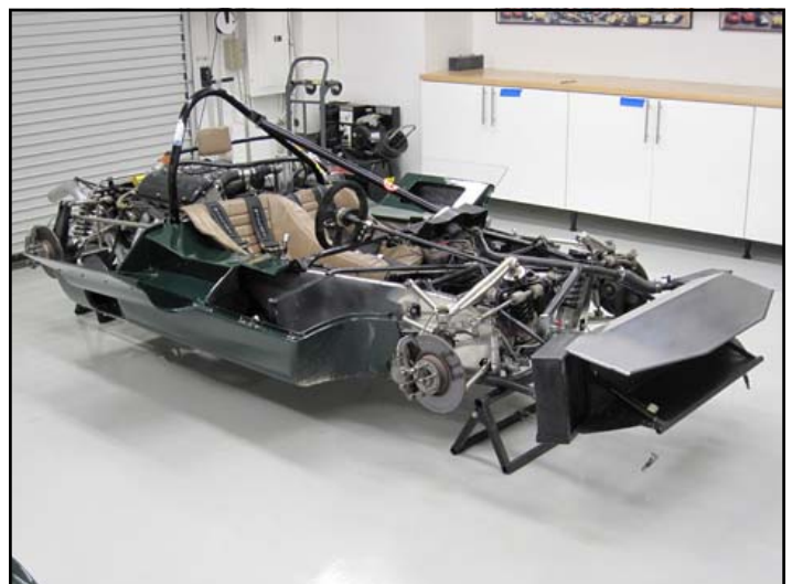
Front Right Three Quarters Body Off

GRAND PRIX Classics, Inc. 7456 La Jolla Boulevard La Jolla, California 92037 U.S.A.