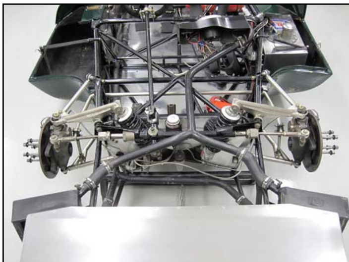
Front Close Up Body Off