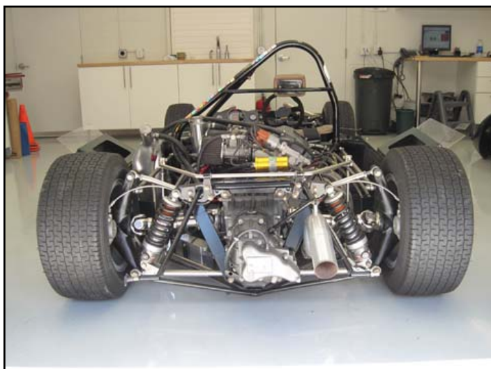
Rear Body Off