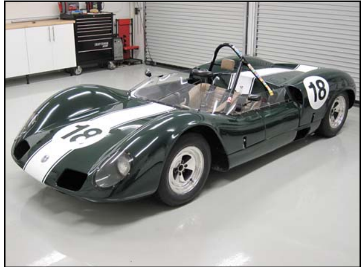
Front Left Three Quarters